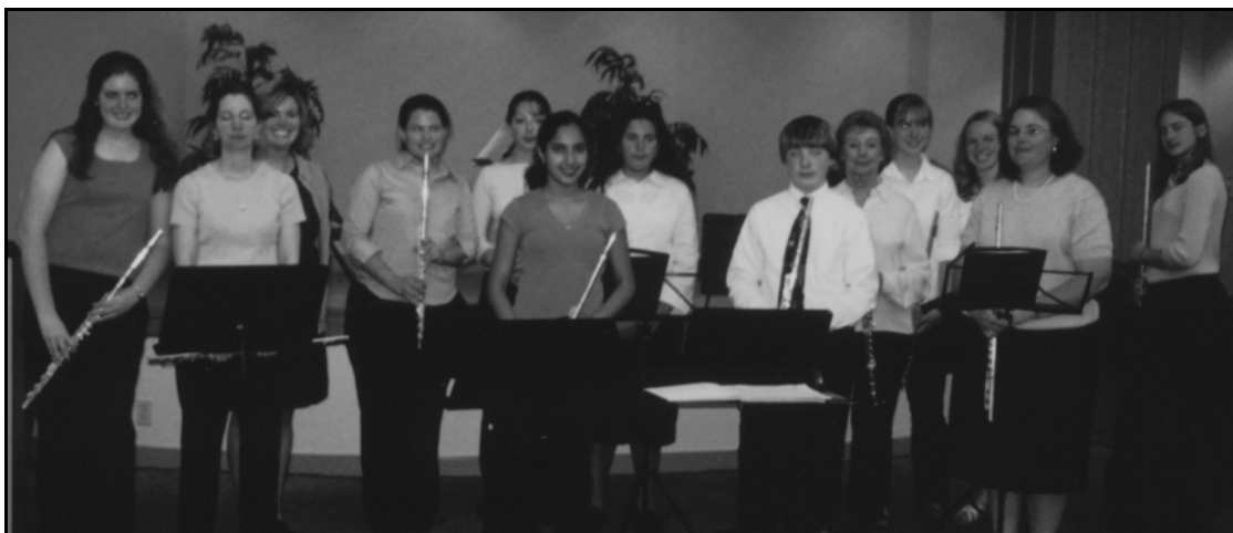
The Silver Pipes Flute Choir May 2004