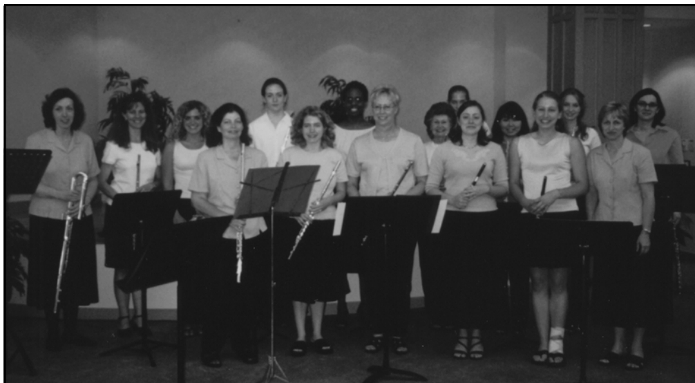
The Silver Fantasy Flute Choir ♪ May 2004

RAFA's flute choir season begins Sunday, September 19 with auditions (1:00 p.m.) and the first rehearsal (2:00 – 4:00 p.m.) at the Jaycee Park Center, 2405 Wade Ave, Raleigh. New members are welcome. Details about each flute choir, including audition requirements, are listed at RAFA's web site at www.RaleighFlutes.org . Be sure to enter the RAFA web site first, then follow the link to "flute choirs".