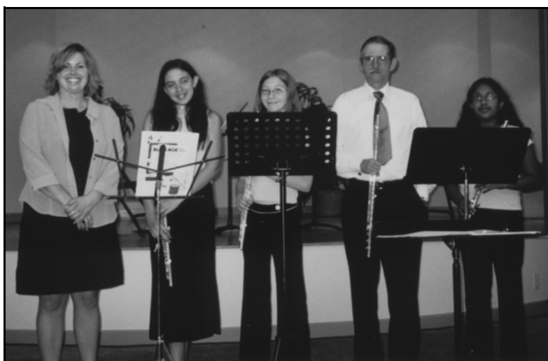
The Silver Winds Flute Choir ♪ May 2004

Rehearsals are held the first, third and fifth Sunday afternoons each month. The groups have performances in December and May. Flute choir fee is $30 per semester for Silver Fantasy and Silver Pipes or $15 for Silver Winds.