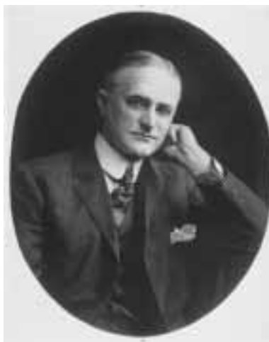
George Eastman, inventor (1854-1932)