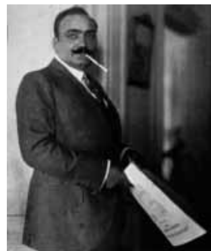
Enrico Caruso, famous tenor (1873-1921) After making a flute recording at the request of an acquaintance, he was asked if he did not intend to purchase it. After hearing himself, he concluded instead that it were better to sell the flute!