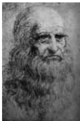
Leonardo de Vinci, painter, sculptor, musician, engineer (1452-1519)

He was proficient on many musical instruments, including Pandean pipes and the transverse flute. An inventor of a number of musical instruments, he never played on any instrument which was not made by himself. It was said that his music "moved the heart and . . . brought tears to eyes that had never shed them."