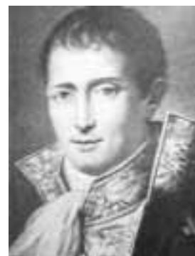
Joseph Bonaparte, King of Spain and brother of the great Napoleon (1768-1844)