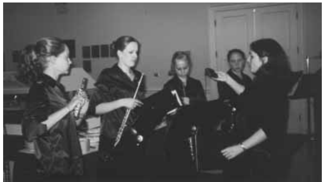
The choir warms up before a concert.