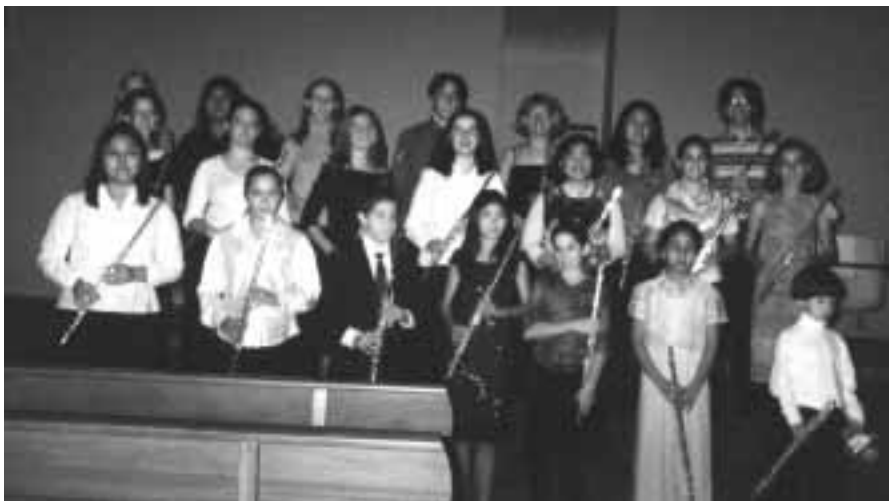
2003 RAFA Contest Winners