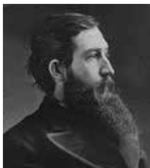
Sidney Lanier, American poet (1842-1881)