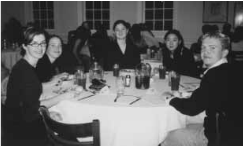
The flute choir's first evening in Raleigh included a performance and dinner with students at St. Mary's School.