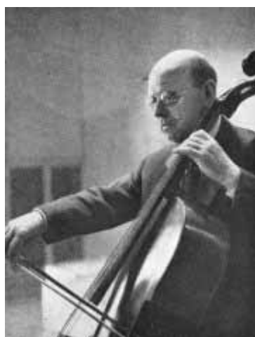
Pablo Casals, famous cellist, conductor and composer (1875-1973)