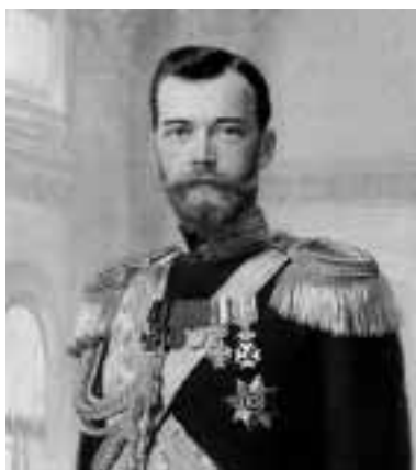
Nicholas II, Czar of Russia (1868-1918)