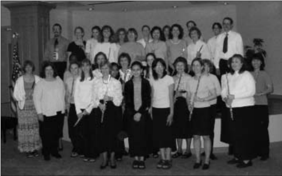
RAFA flute choirs performed at Glenaire Retirement Community as part of the RAFA Members' Recital on May 18.