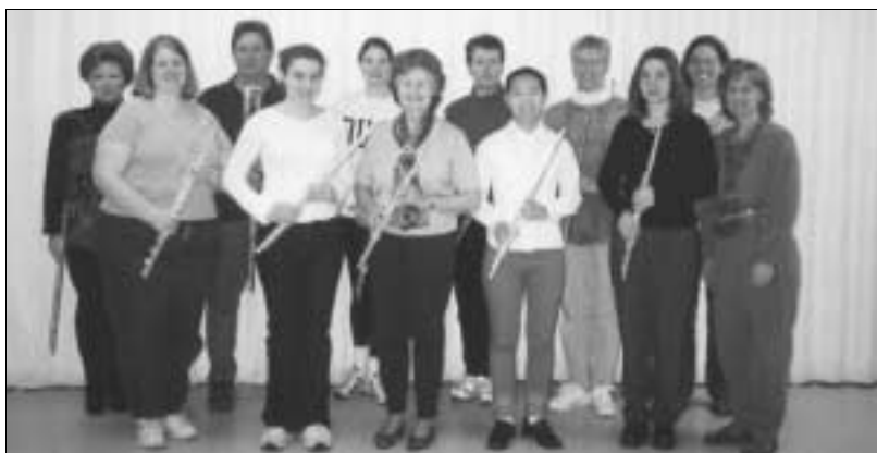
Silver Fantasy Flute Choir