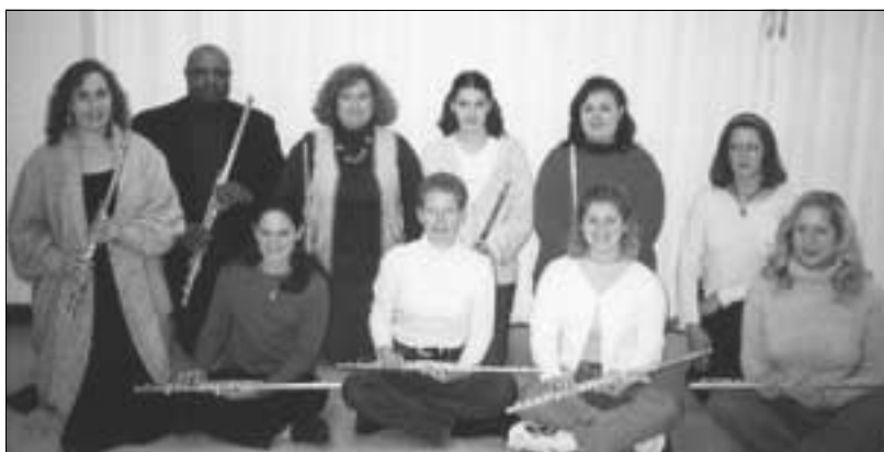
Silver Winds Flute Choir