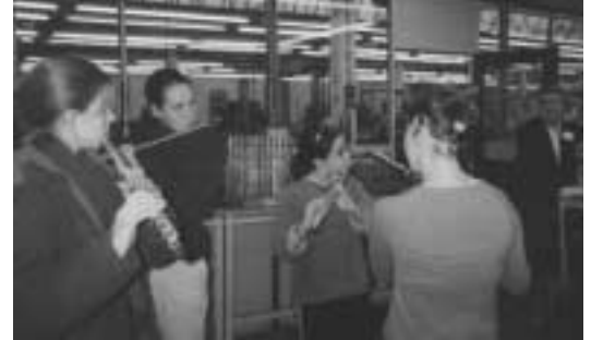
Trying out newly made flutes at the Boosey & Hawkes factory

I've never done this before, so it was a learning experience for me, too. I love to travel, I love the flute, and I love my students, so this seemed like a natural combination. The trip exceeded my expectations on all levels. If the memories of this trip help the girls to strengthen their commitment to the flute, then I'll feel it was all worthwhile.