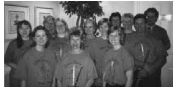
Silver Fantasy Flute Choir