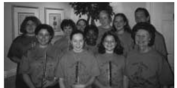
Silver Winds Flute Choir